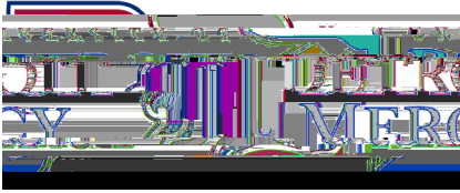
Table B: FACILITATING STUDENT LEARNING IN IT1.1